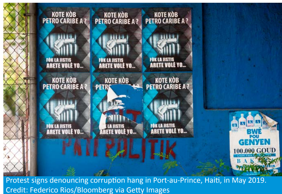
Protest signs denouncing corruption hang in Port-au-Prince, Haiti, in May 2019.

And after all the unrest, still no one has been held to account for the vast corruption. No money has been returned and no one has gone to jail. Understandably, the anger that triggered the protests remains. People deserve answers, and they deserve justice. They will continue to ask 'Kot kob Petrokaribe?'