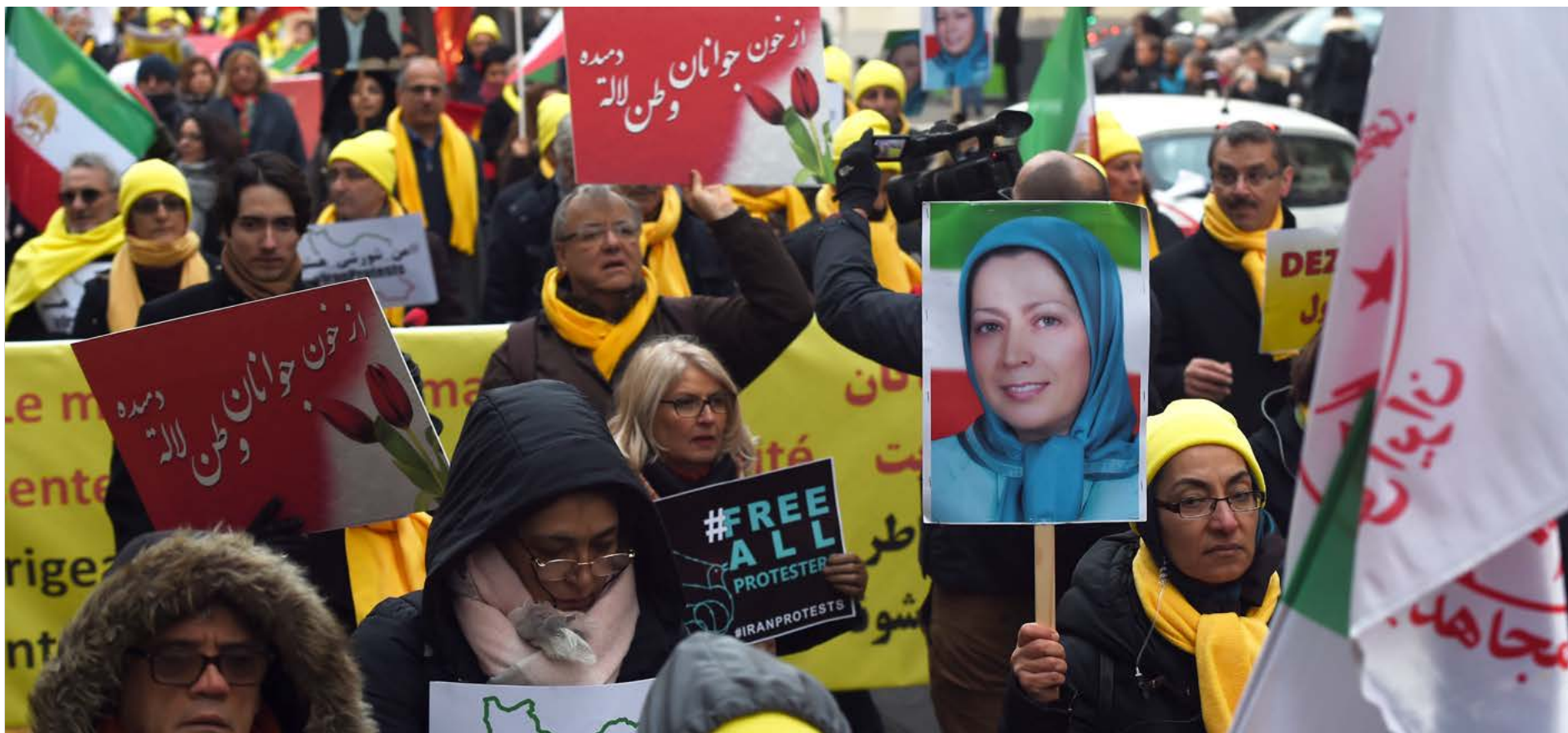
People in Paris, France, demonstrate in support of the uprising and against repression in Iran in December 2019.