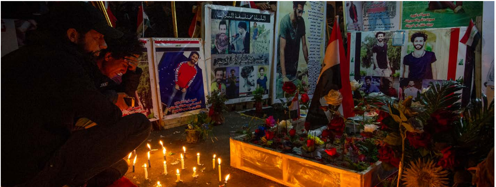
Anti-government protesters light candles in Baghdad, Iraq, to mourn those killed as nationwide protests enter a third month on 6 December 2019.

Whichever candidate eventually prevails will have to be acceptable not only to various political factions but also to Iran. Whether they are acceptable to the many people who protested seems to be a question the ruling elite is less concerned about. The process of appointing a new prime minister is not one that the many young people who continued to protest into 2020 have any say in, and whoever is appointed is unlikely to satisfy them. Whoever becomes the country's next leader can expect to face continuing protest pressure to make real progress on tackling corruption, creating jobs, redistributing wealth and opening up democratic and religious freedoms. That is a full agenda, to which surely now will be added another demand – that of delivering real justice for the hundreds of people who have been killed by a system that refused to listen. A continuation of governance as usual cannot be expected to provide the answers.