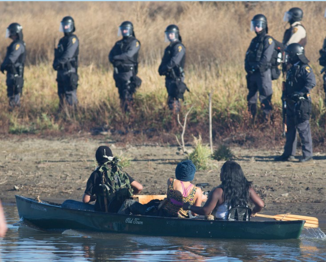
Image: Water Protectors Dakota Access Pipeline Protests

In June 2019 it was announced that the US federal government was introducing legislation that would punish people with sentences of up to 20 years in prison for the action of ‘inhibiting’ the operation of an oil or gas pipeline. Civil society continues to resist the new restrictions. Lawyers in the USA are suing against the new laws, seeking to protect people’s freedom to express dissent, and activists around the country continue to demand the end of the USA’s reliance on fossil fuels.