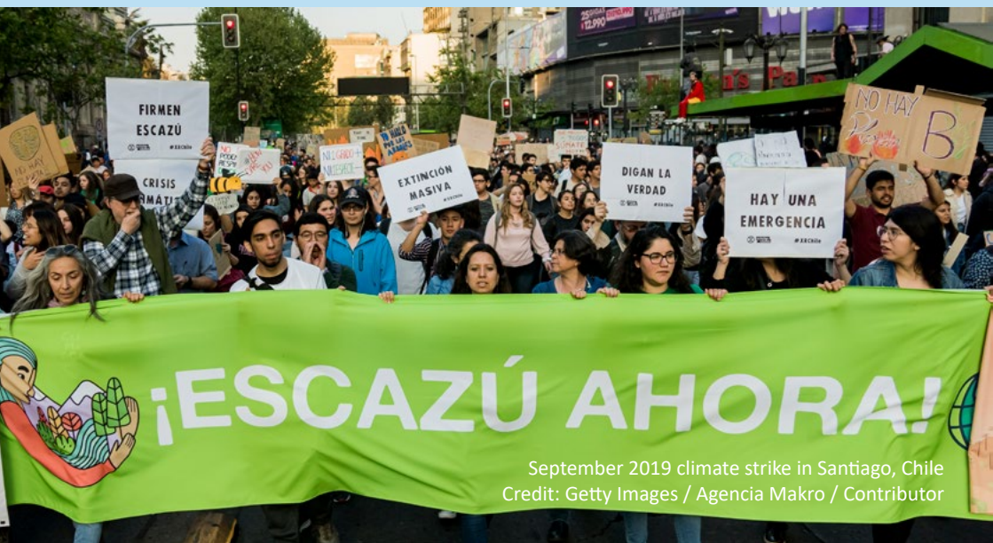
September 2019 climate strike in Santiago, Chile

The Escazú Agreement is also an important tool to promote and guarantee climate action. For countries in Latin America, home to the Amazon rainforest, ensuring access to environmental information, participation and justice and a safe environment for defenders should be key steps in meeting their climate commitments.